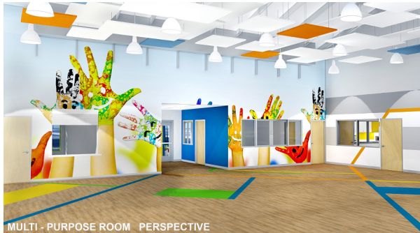
MULTI - PURPOSE ROOM - PERSPECTIVE